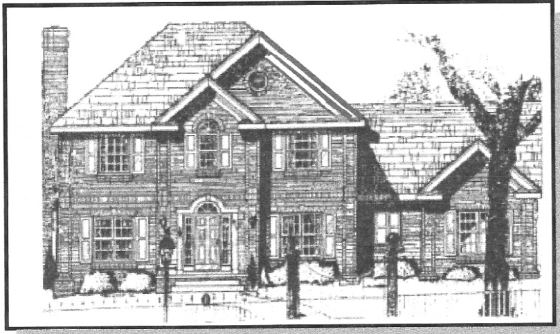
Brick Front Optional

Master Suite w/ Octagon Super Bath, His & Her's Walk-In Closets, 3 Additional Guest Bedrooms w/ Jack & Jill Bath plus Full Bath in Hall, Optional Bonus Room over Garage, Gourmet Kitchen w/ Breakfast Bar or Island, Family Room w/ Gas Log Fireplace, Side Load Oversized 2 Car Garage, Hip Roof, Full Walk-Out Basement, Optional 9 Ft. Ceilings. Brick Front or Front Porch Optional. Several Elevations to Choose From.